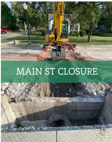
MAIN ST CLOSURE

Storm sewer work continues for the Brown Avenue reconstruction project and Main Street remains closed.