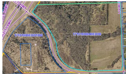
Parcel 4b: 1710100003001000