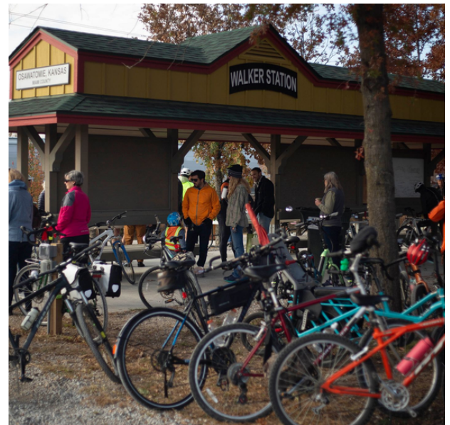
Hundreds of cyclists and trail supporters descended on Osawatomie in October 2022 to celebrate the 2022 RAISE Grant award received by Kansas Department of Wildlife and Parks. Of the $24.8 million award, roughly $7 million will be spent between Osawatomie and Rantoul to complete the trail.