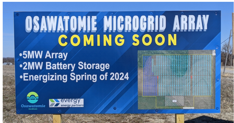
Two signs, produced by local print shop Pat's Signs, are in place at the intersection of 335th and Osawatome Road at the future site of the solar array.

The City of Osawatome and Evergy are excited to be breaking ground soon on a 5MW solar array in the City's Northland! Located north of Osawatome State Hospital, at the intersection of 335th and Osawatome Road, this new facility will be a welcome addition to the City's electric generation portfolio. The array will cover roughly 40% of the 76-acre parcel owned by the City of Osawatome and is anticipated to break ground sometime