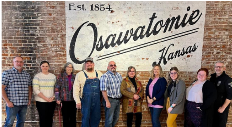
Some members of the OzCOMP steering group posed for a photo after the interviews held in downtown Osawatome.

Following the success of last year's original Planning Sustainable Places planning effort, the City applied for a second phase "Implementation" grant through Mid-America Regional Council to continue developing plans for downtown revitalization and encouraging active transportation. The City was awarded $80,000 for Phase II planning, which formally began earlier this year. Members of the OzCOMP steering committee met downtown to interview the architecture and design teams that had applied to work with the City on this Phase II project. OzCOMP is comprised of City staff members, members of the City Council, and representatives from a number of community organizations including the Board of Education, Tourism Committee, Trail Commission, Rotary Club, Planning and Zoning Commission, Osawatome PRIDE, and the Ministerial Association, among other groups.