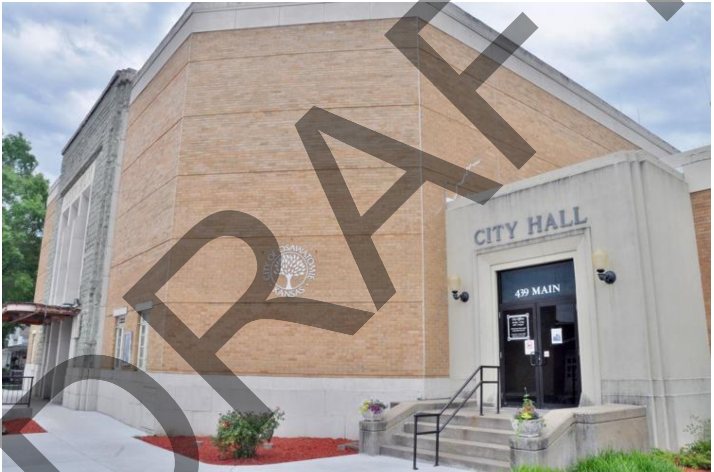
Osawatomie City Hall