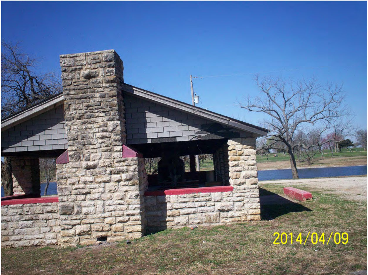
Shelter House 8