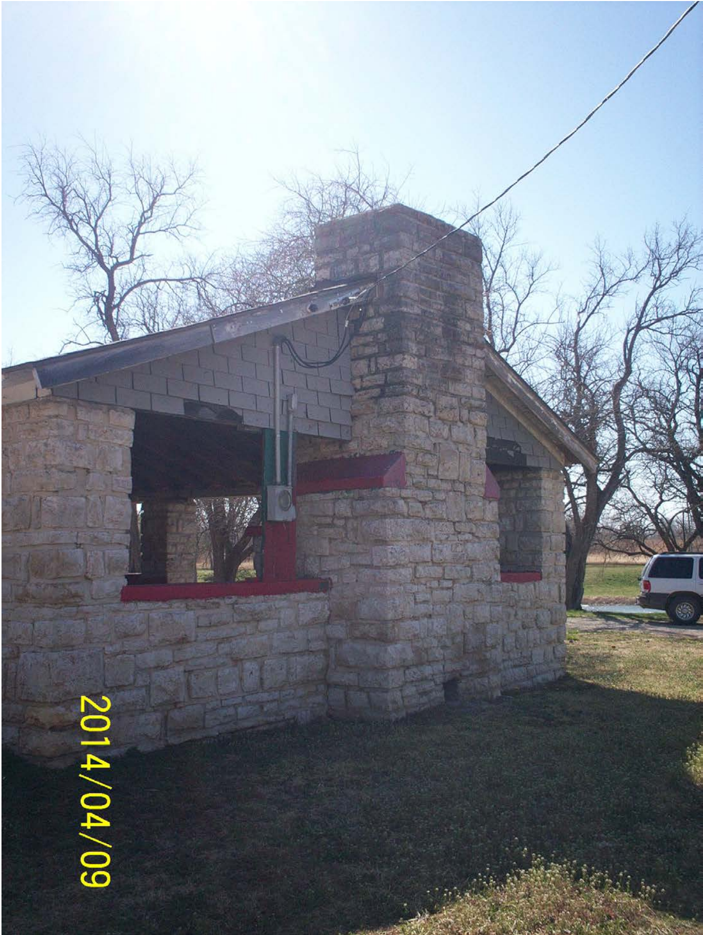
Shelter House 2