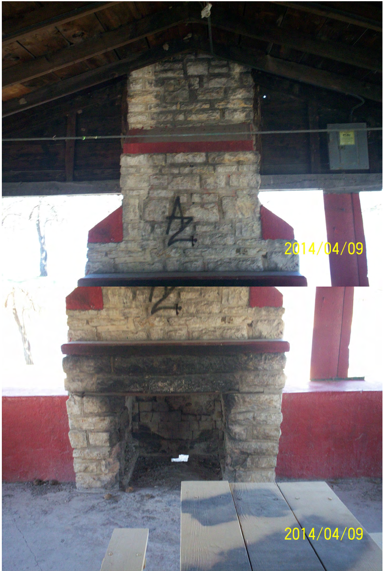
Shelter House 5