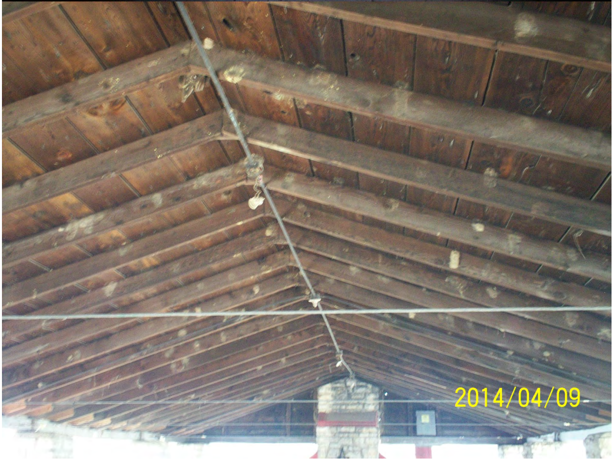
Shelter House 13