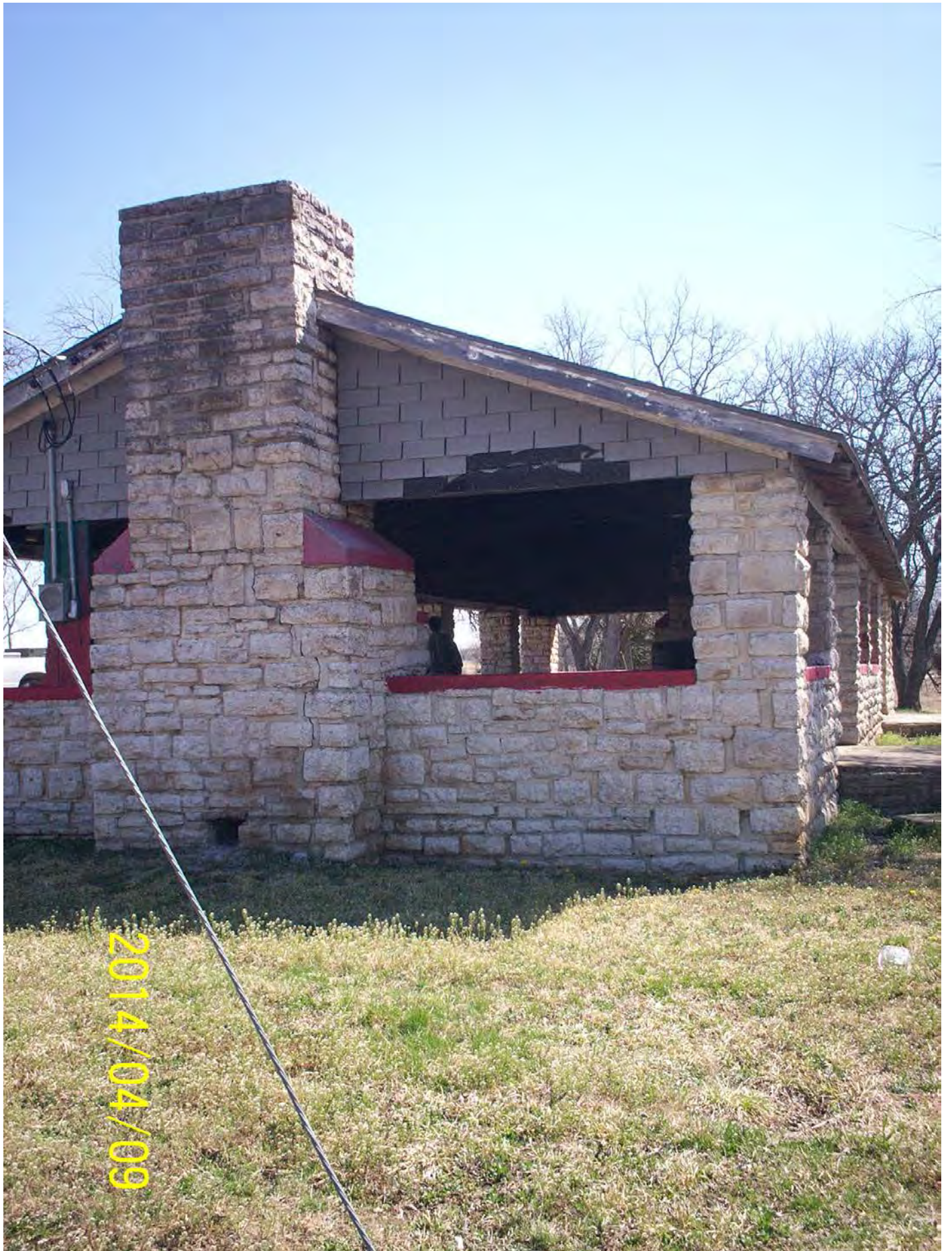
Shelter House 3