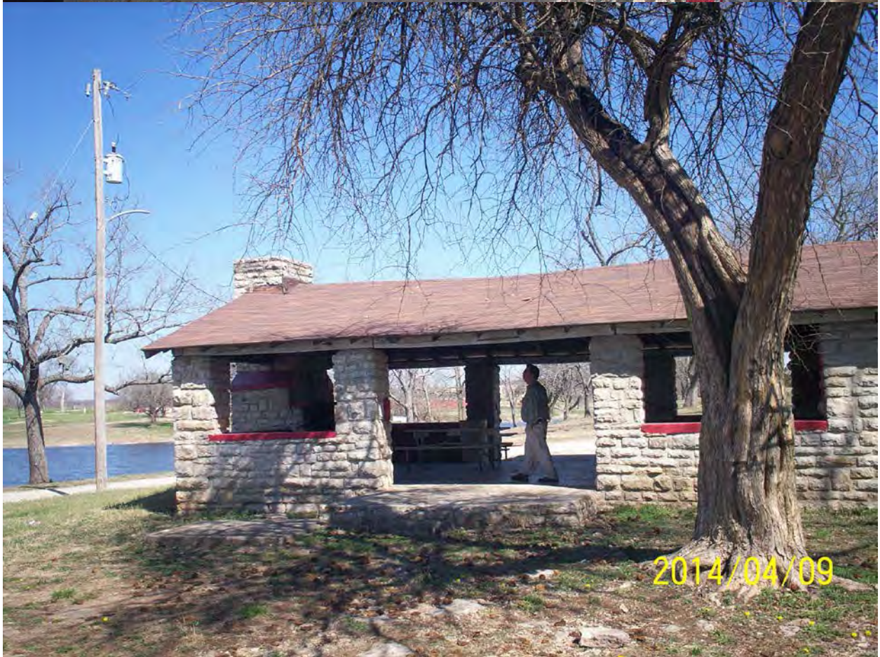
Shelter House 6