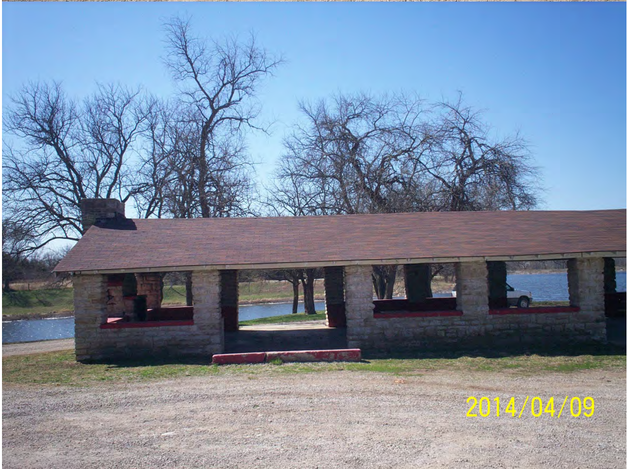
Shelter House 1