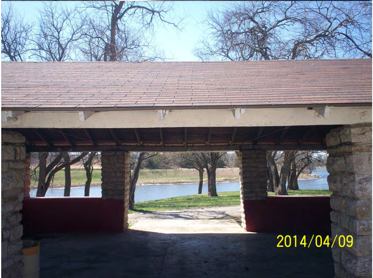
Shelter House 12