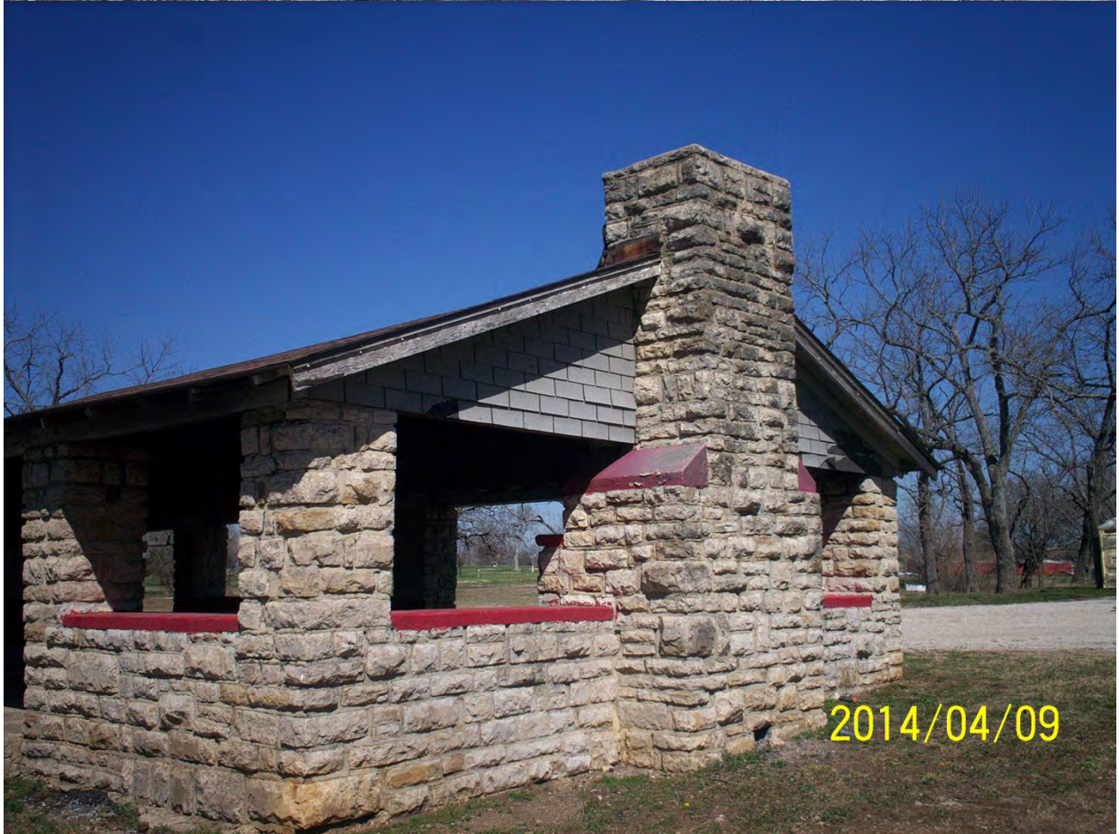
Shelter House 7