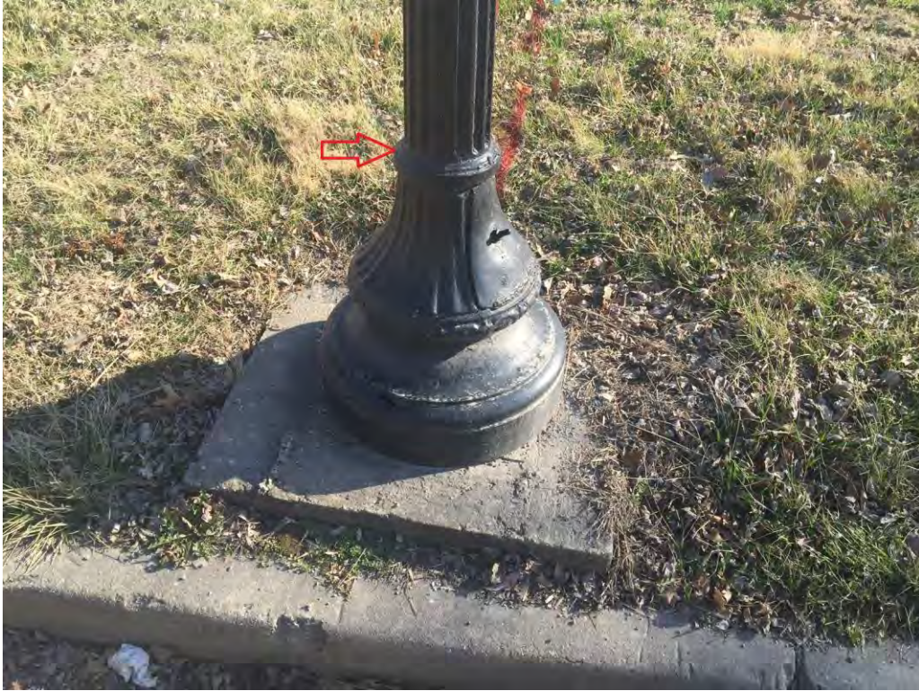
Pole has been rewelded to base