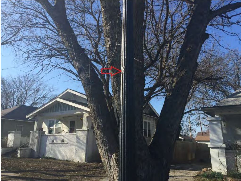
Pole has been welded back together