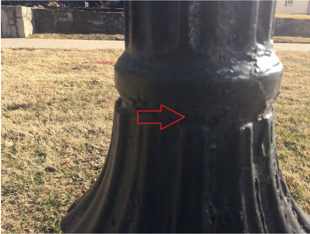
Deterioration at pole/base junction