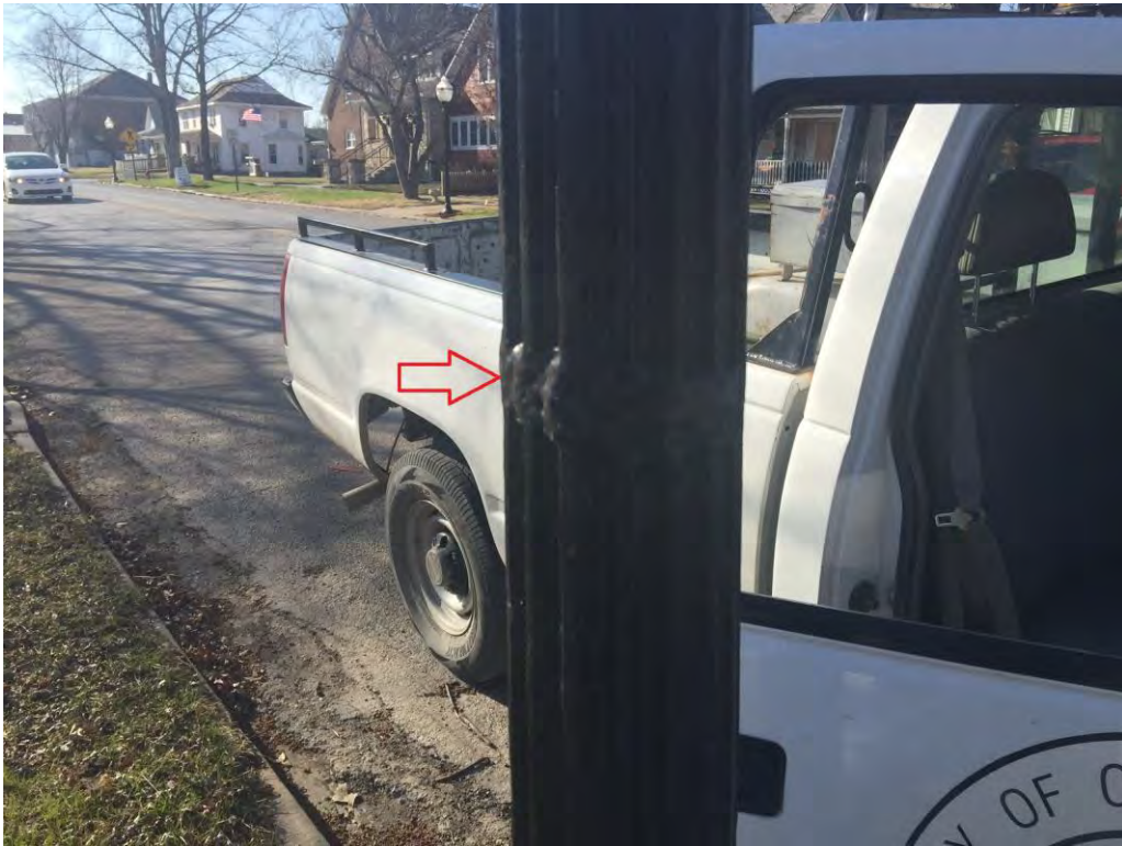
Pole has been welded back together