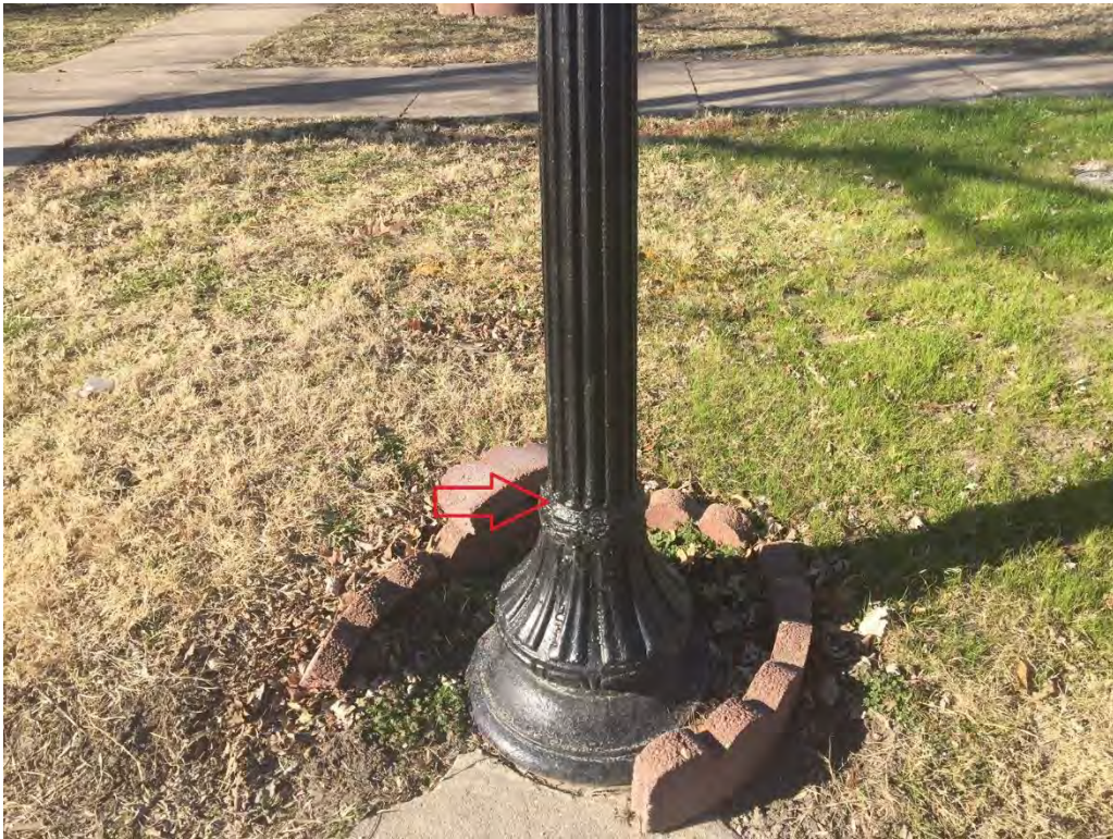
Pole has been rewelded to base