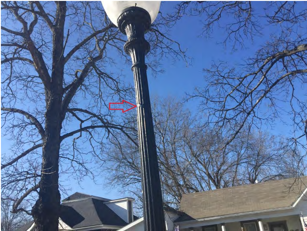
Pole has been welded back together