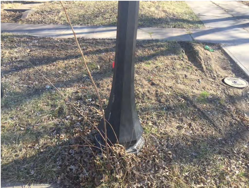
Pole is dissimilar to others