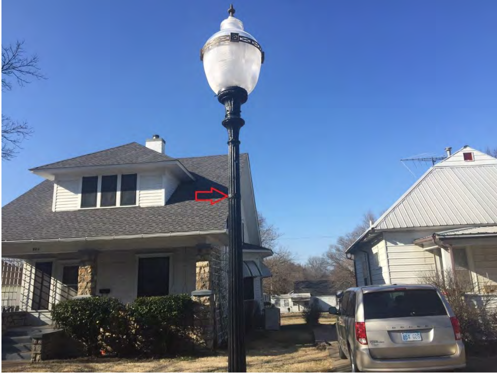
Pole has been welded back together