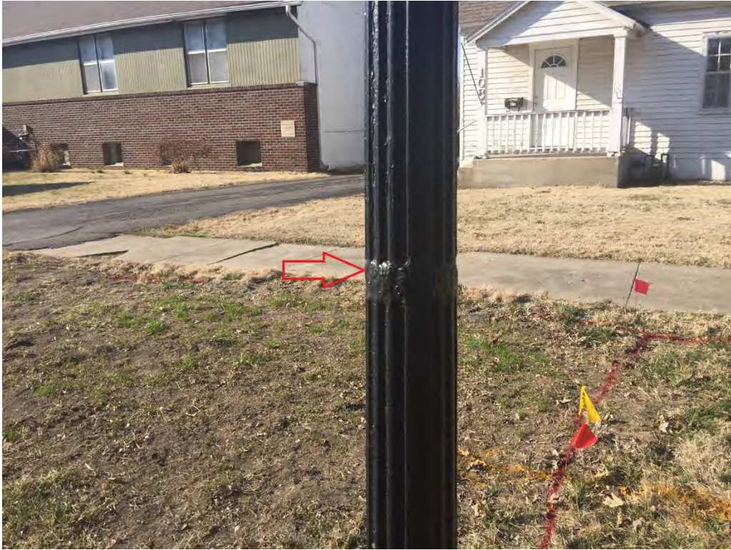
Pole has been welded back together