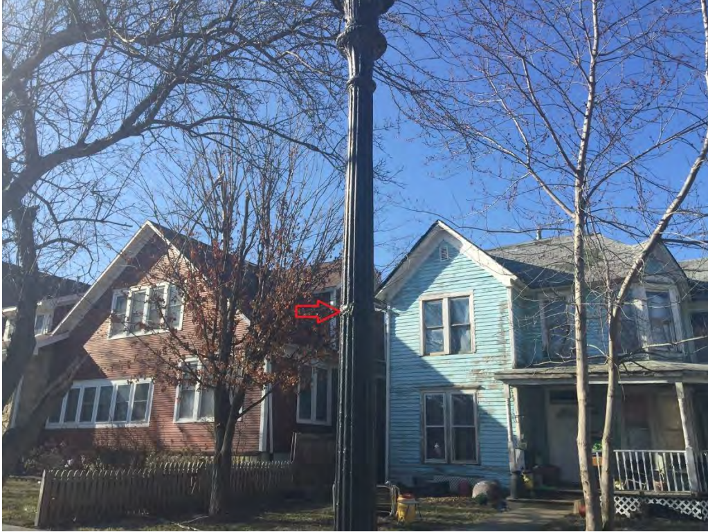
Pole has been welded back together