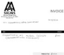
IMG_3966 (1).jpg 291K