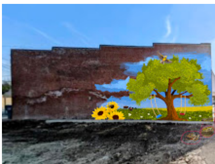
IMG_3970 (1).jpg 608K